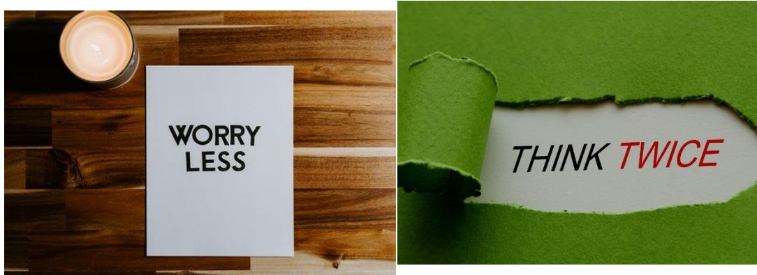
Figure 1: Activity 1: 2 words 2 minutes

Note. these are examples which could be used for this activity.