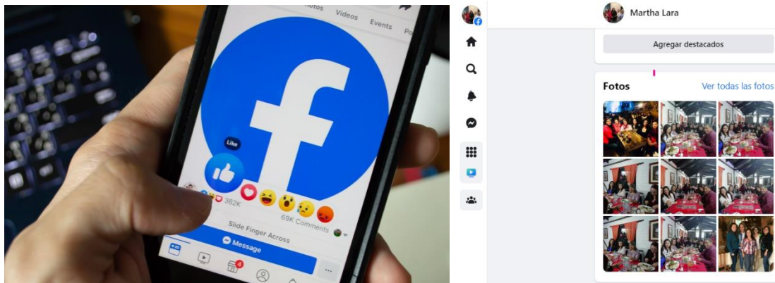
Figure 5: Activity 5: Social media photos

Note. Figure 5 displays one of the most used social networks and an example of the photos that users usually upload to this technological tool.