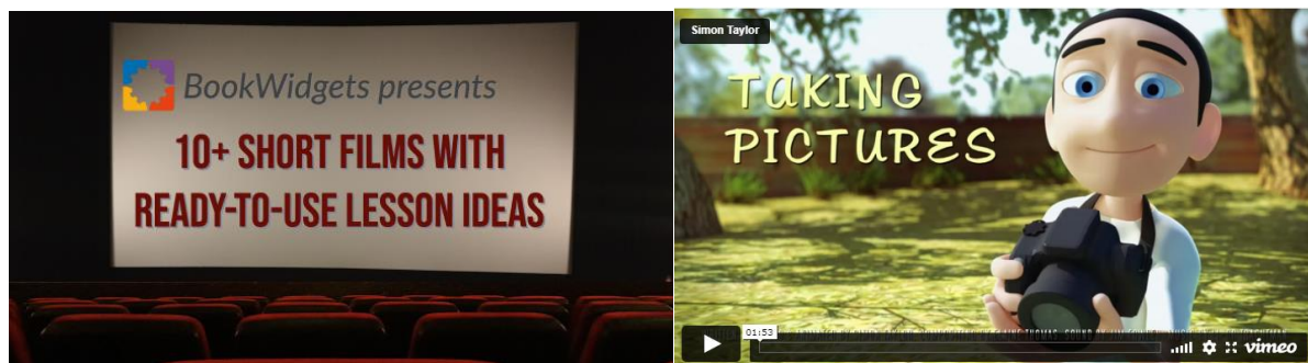
Figure 3: Activity 3: Short videos

Note. In figure one, a website where teachers can find useful resources and the example of a silent video are presented. The pictures were taken from these links https://storage.googleapis.com/ibw-blog/media/ce/b408d8a7ce6328d09de21411c83bf7.png https://vimeo.com/119520956?embedded=true&source=vimeo_logo&owner=515469